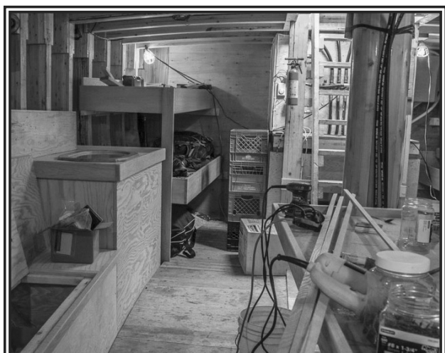
Although still not finished, a lot of work has been done below deck showing the bunks and the mid-ship ladderway.

including installation of the masts, and a host of other rigging, plus partial completion of the crew and cargo spaces below deck.