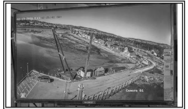
A camera mounted high on the mast shows roads from Parrsboro's Public Wharf back towards town. The large screen in the lower deck enables crews to keep an eye on the sea around them.

South CumberlandNEWS is proud to provide coverage of community events.