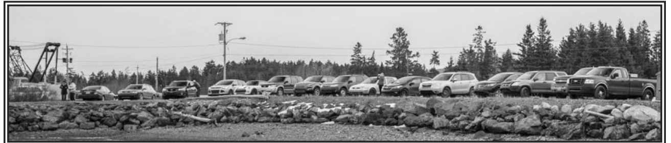
The wharf was lined full of cars as over 200 people came to say "good-bye".