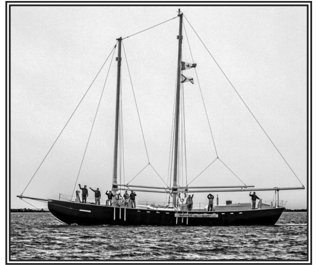
The Katie Belle crew waves goodbye as they leave Parrsboro Harbour for Saint John, before heading south for sea trials. It is expected to return to Nova Scotia this summer.