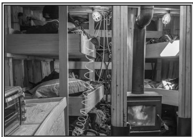
There's still a lot of work to be done, but it can be accomplished as the Katie Belle undergoes sea trials. This photo shows the bunks up towards the bow.