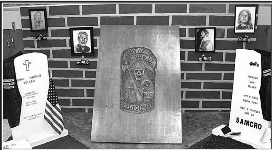
Green Team won first place for their Sons of Anarchy decorated corner at Debert Winter Carnival.