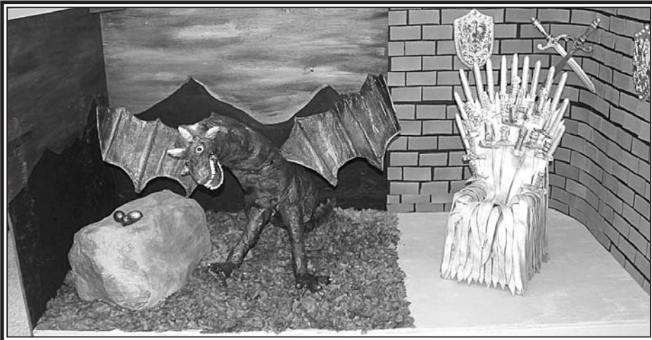
Blue Team's Game of Thrones themed decorated corner at Debert Winter Carnival.