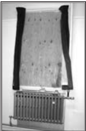
Several windows in the Debert Military Museum have been enclosed to protect the artifacts from sunlight. Screens are being installed on the outside to protect the glass from vandalism.

A new roof was installed last fall, complete with ventilation turbines and the renovations are continuing at the Debert Military Museum.