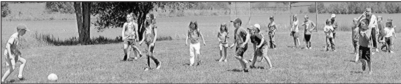
Great Village Elementary students enjoyed Field Day activities on a sunny June 15th. A game of soccer was one of the afternoon events.