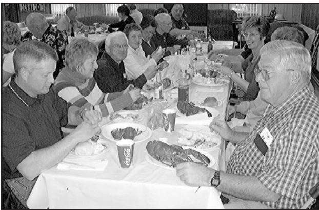
The Onslow-Belmont Fire Brigade held their annual Steak & Lobster Party on May 30th at the fire hall. Regular, retired and honorary members along with invited guests came together for the social evening.