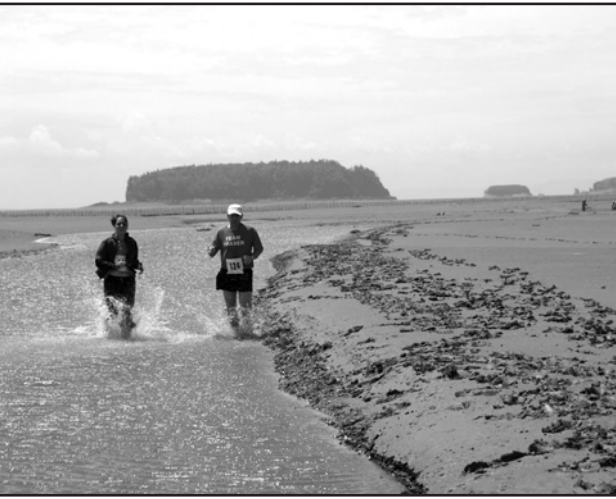
Not Since Moses Race, where as many as 800 people are here for the runs which happen the weekend of June 26 to 28. See more information in the 'Mo's At Five Islands' feature on pages 11-14.