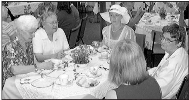
Tea party at noon! Many ladies from the community enjoyed a delightful lunch at Debert Baptist Church on June 2nd. The Atlantic Baptist Women's group of Debert Baptist Church hosted the event in celebration of the 132nd Anniversary of the Women's Missionary Society.