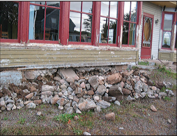
A crumbling rock wall foundation indicates a building needs major repairs. Shown above is the foundation of Mel's Find Food in Five Islands, before Dick Lemon re-constructed the building to take on a new life as Mo's with dining, a hostel for 10 people and much more.