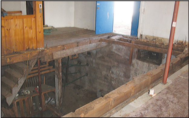
After the concrete foundation was installed, Doug Yorke's crew had to replace beams, sills, and flooring to "square up" the building and bring it up to code. Then they worked their way throughout the building to make it as energy efficient and as modern as it is today. Mo's at Five Islands will soon become an icon and destination for locals and visitors to the area.

Join us for a visit! You'll be glad you came... We'll show you it's easy to stay!