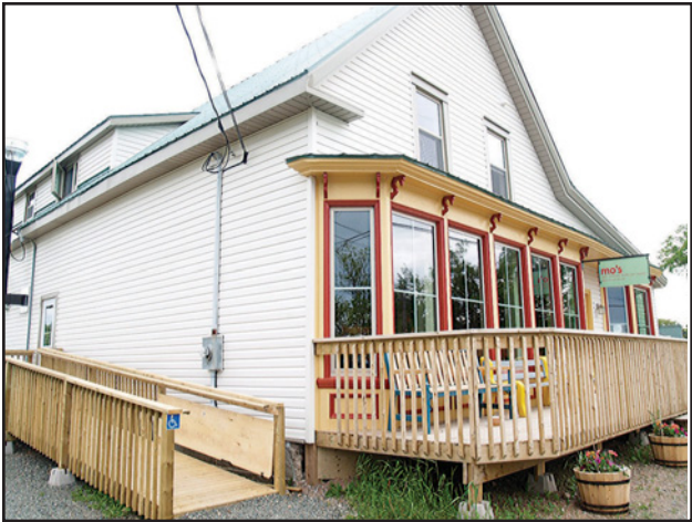
The newly installed wheelchair ramp leads right into the dining area.

Join us for a visit! You'll be glad you came... We'll show you it's easy to stay!