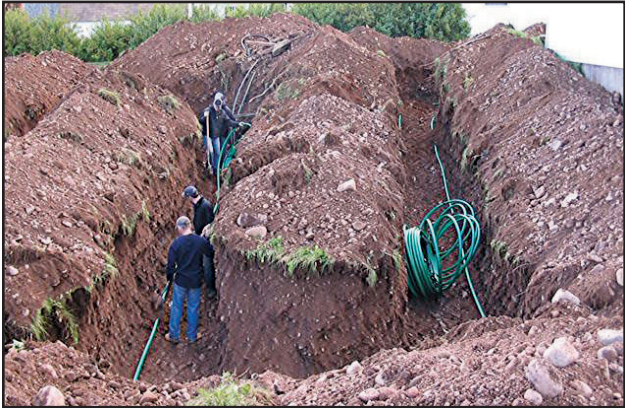
To reduce energy costs and reduce carbon emissions a geothermal heating system was installed at Mo's in Five Islands. Geothermal systems have a significant up-front capital cost but property owners normally get a total payback within seven years and enjoy the fact they never to buy oil or wood again.