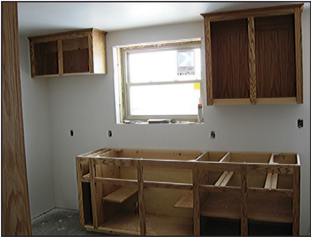
Once the walls were insulated and gyproc was finished, it was time to install cabinets and counters in the kitchen and other areas. Two one-bedroom apartments have been constructed for the facility manager and the chef.