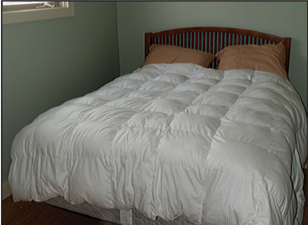
A queen size bed is offered in one of the rooms at the hostel, which can accommodate 10 people.