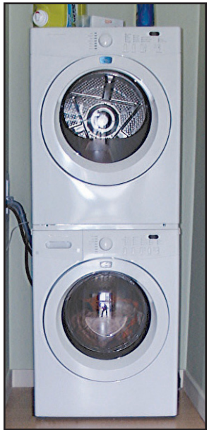
Laundry facilities are also offered in the hostel.

who had been on-site and Mo's Café, moved over to the next project at the end of May to execute major renovations within a two month period.