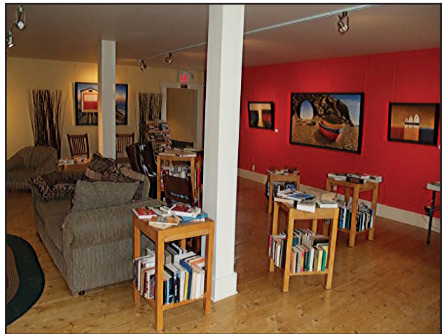
Visitors to Mo's are greeted with a bright spacious reading area, which also includes books for sale, an internet connection and comfortable seating.