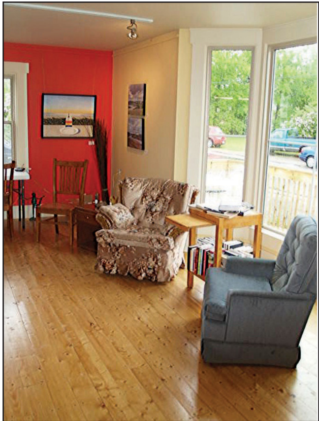
Comfortable chairs and an open reading area affords a view of the front deck and local scenery at Mo's in Five Islands