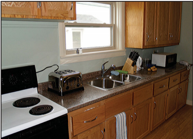
A spacious kitchen area in the 10 person hostel makes an overnight stay in Five Islands even more enjoyable.