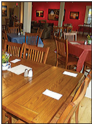
When seated in the dining area at Mo's of Five Islands, visitors can view the reading area, or look over at the wood fired pizza oven.