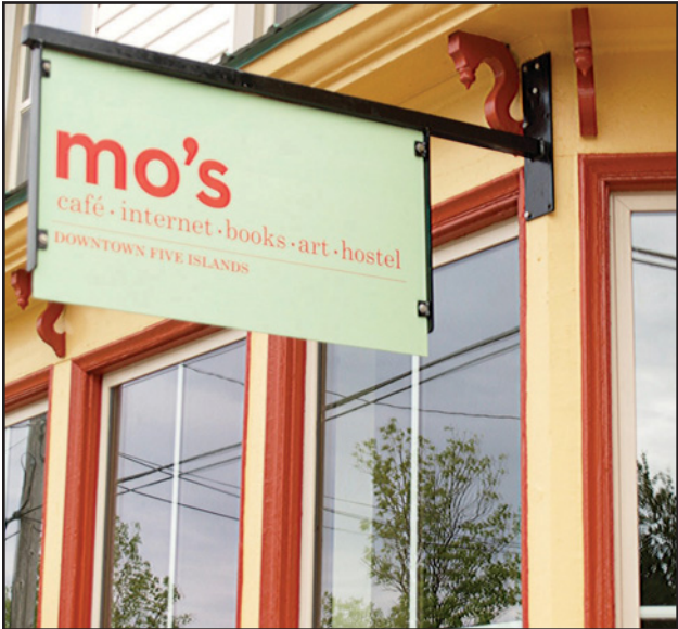
During the past year major renovations have converted the building into a bright professionally decorated "must go to" destination.

was already taking on a greater magnitude than originally conceived. The rock wall foundation was replaced with a concrete foundation, sills had to be replaced, the building leveled. Entire floors were replaced. The septic field was replaced, and a $60,000.00 geothermal heating system installed. The entire building envelope was