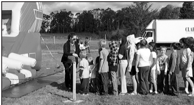
Kidz Karnival Fall Kickoff was held at the Faith Baptist Church in Great Village and many children turned out to enjoy the day of fun.