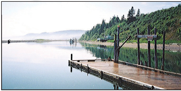
Port Greville Harbour at high tide showing the boat launching ramp.

Port Greville Beach is the location of the former Wagstaff and Hatfield Shipyards of years ago. The buildings and wharves have been taken away by nature, but miles of coastal area remains as reminder of the untouched beauty. Port Greville is home to the Coach House Bed and Breakfast, the Ebb Tide Bed and Breakfast and Shaws Country Antique Market. At the antique market you can find anything and