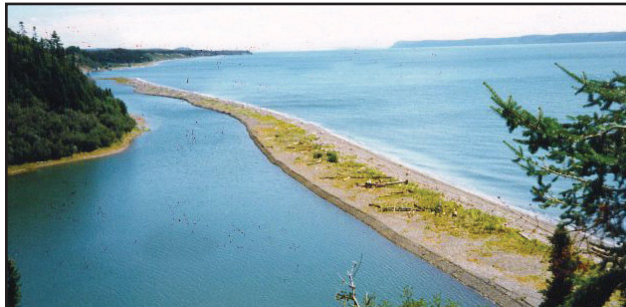
An eastern view of Wards Brook Beach at high tide.