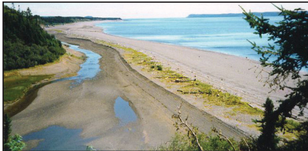
An eastern view of Wards Brook Beach showing low tide taken just six hours later.