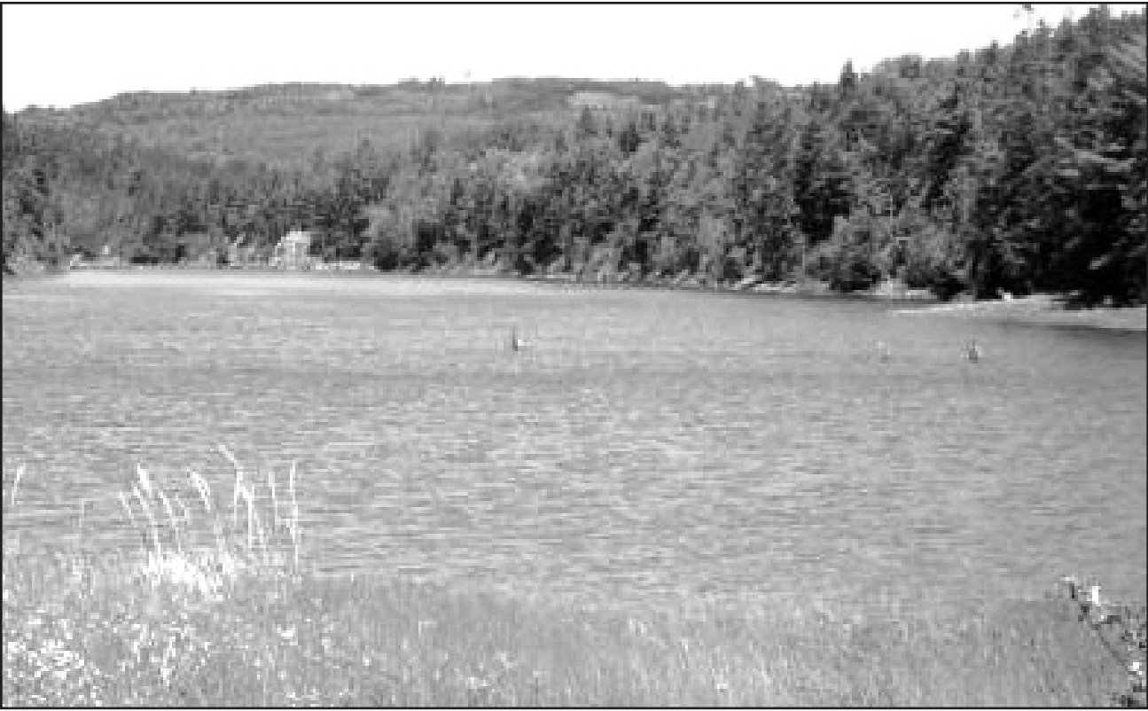
Swim in the our prestine waters. Here, at Moose River, the fresh water flows to the salt water of the Bay of Fundy.