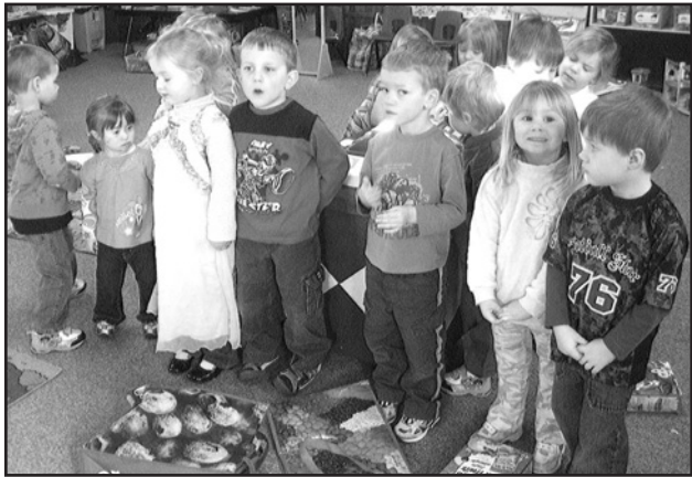
With the arrival of spring, these students at Lower Onslow Playschool will soon be able to enjoy a variety of outdoor activities.

It has been an interesting winter for attendance at Lower Onslow Playschool. With the arrival of spring we will get more outdoor activities into our plan. We will be planting and watching for those wonderful signs of the new season.